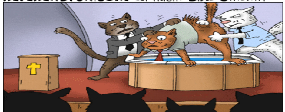
Thanks to Pam Winn TROUBLE IN CAT CHURCH