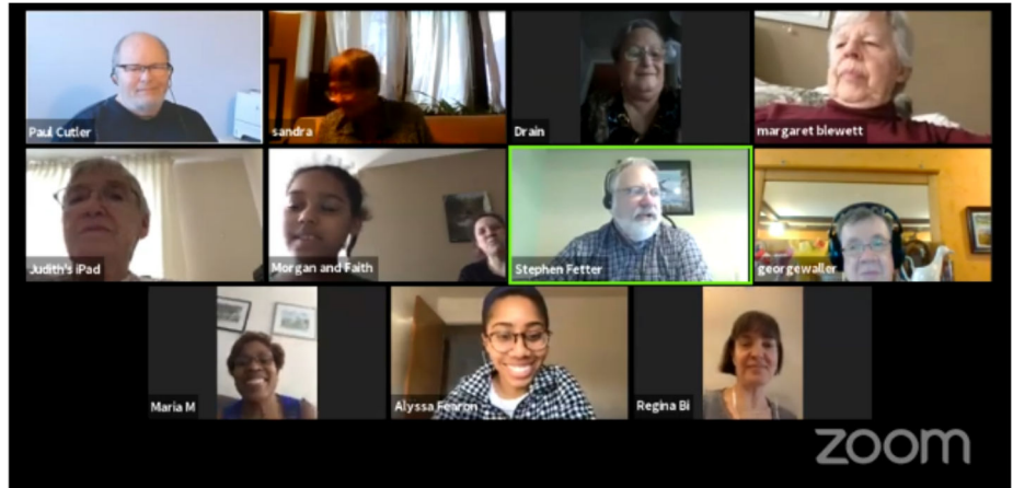
Watch the Zoom Worship Service on the Sanctuary's big screen